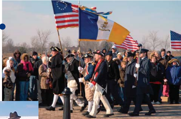
Ohio Society Color Guard advances the Colors to begin the Wreaths Across America Program at the Ohio Western Reserve Cemetery in Rittman, Ohio on December 13, 2008.