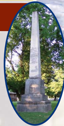
Pictured top, left to right: Colonel Crawford Monument, Battle of Sandusky Monument bottom, left to right: Gnadenhutten Monument, Battle of Olentangy Monument (Seccaium Monument)