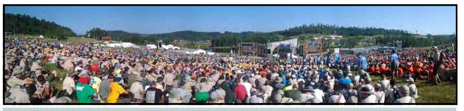
Opening Show of the 2013 National Boy Scout Jamboree at beautiful Summit Bechtel Reserve, W. Va.