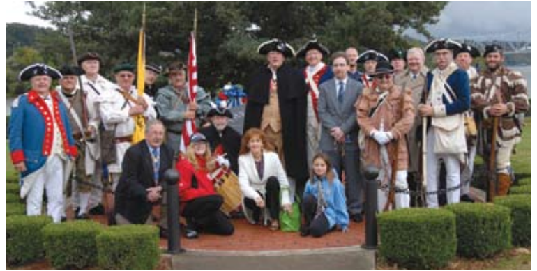
▲ Members of Ohio Society that participated in Battle Days and the Wreath Laying Ceremony at Pt. Pleasant, WV.