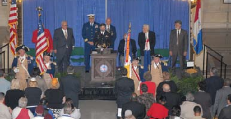
▲ Western Reserve Society Color Guard retires the colors at the Joint Veterans Commission of Cuyahoga County, Veterans Day program, Cleveland City Hall.