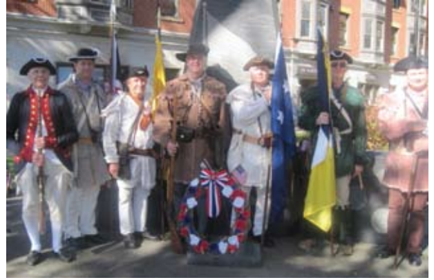
▲ Hocking Valley Chapter in Veterans Day Parade.