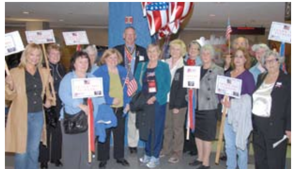
▲ Greater Cleveland Honor Flight at Hopkins Airport with Cleveland area DARs.