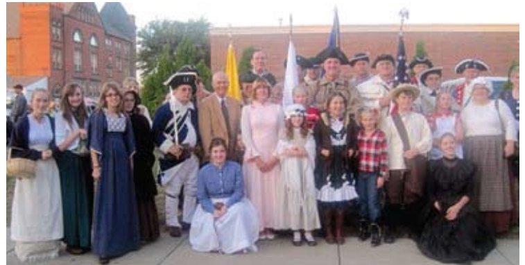
▲ The OHSSAR Color Guardsmen participated in a few of the parades at the Pumpkin Festival, Circleville, Ohio.