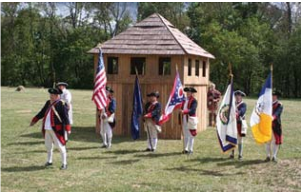
▲ Ebenezer Zane Chapter members present the colors at Ft. Henry Days in Wheeling, WV.